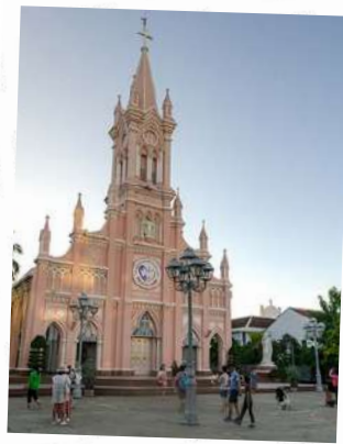
The Rooster church