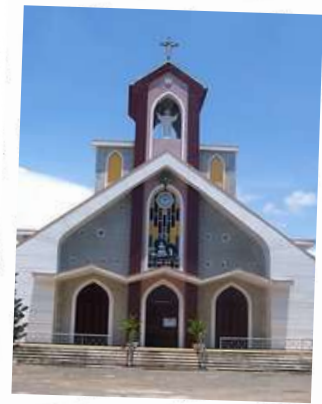
Hoi an church