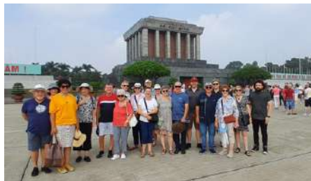
Ho Chi Minh Complex